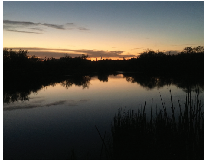
Quitobaquito Springs

In the middle of the hot, dry desert lies Las Playas, a group of dry lake beds with no drainage outlets. When the rare rain falls in the central part of Cabeza Prieta, it flows into the ephemeral lakes, located next to the international boundary. When the playas are wet, the flora and fauna come to life and the playas become islands of emerald green. They host a number of plant and animal species that are rare in the U.S. or Sonoran Desert, including the federally endangered Sonoran pronghorn. Forage areas such as the playas will become increasingly important as the climate becomes hotter and drier. For this reason, Las Playas is a unique biological resource.