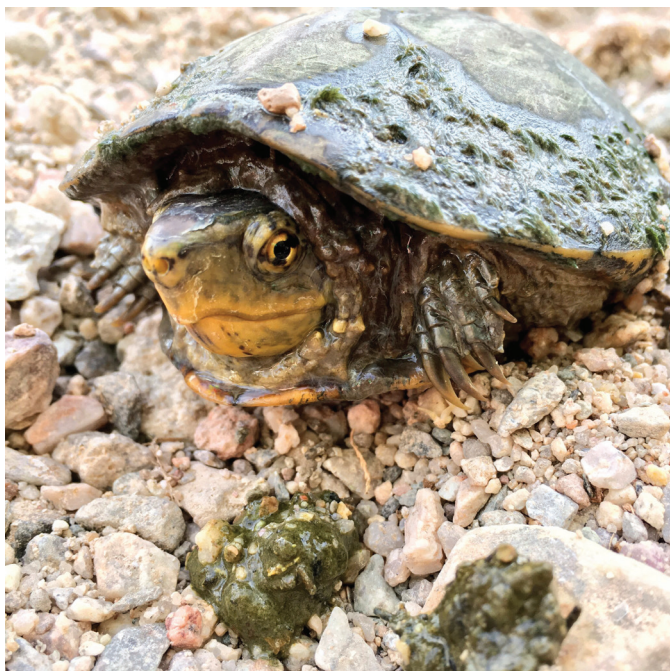
Sonoyta mud turtle

lives serve as reminders of frontier lifeways. The Grays left behind a ranch house, outbuildings, corrals, and a farm field that are part of a cultural landscape listed on the National Register of Historic Places. These historic features overlay important prehistoric sites.