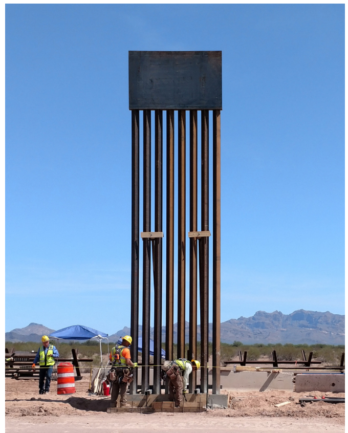
Border wall construction, August 22 nd , 2019, Anonymous