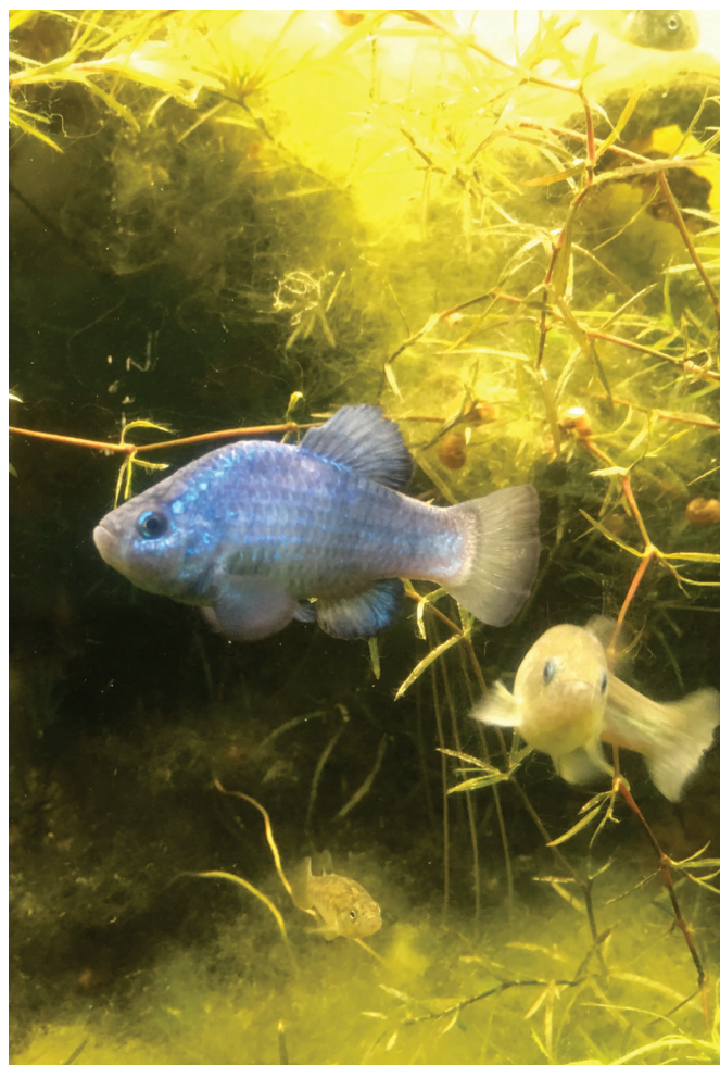
Quitobaquito pupfish

El Gran Desierto de Altar is the largest active dune system in North America and is known for its magnificent star and crescent dunes. Most of the Gran Desierto is in Mexico but part of this system extends into the U.S. and is known as the Pinta Sands. Many species of plants and animals are found only in the Gran Desierto, such as the fringe toed lizard, flat-tailed horned lizard, giant Spanish