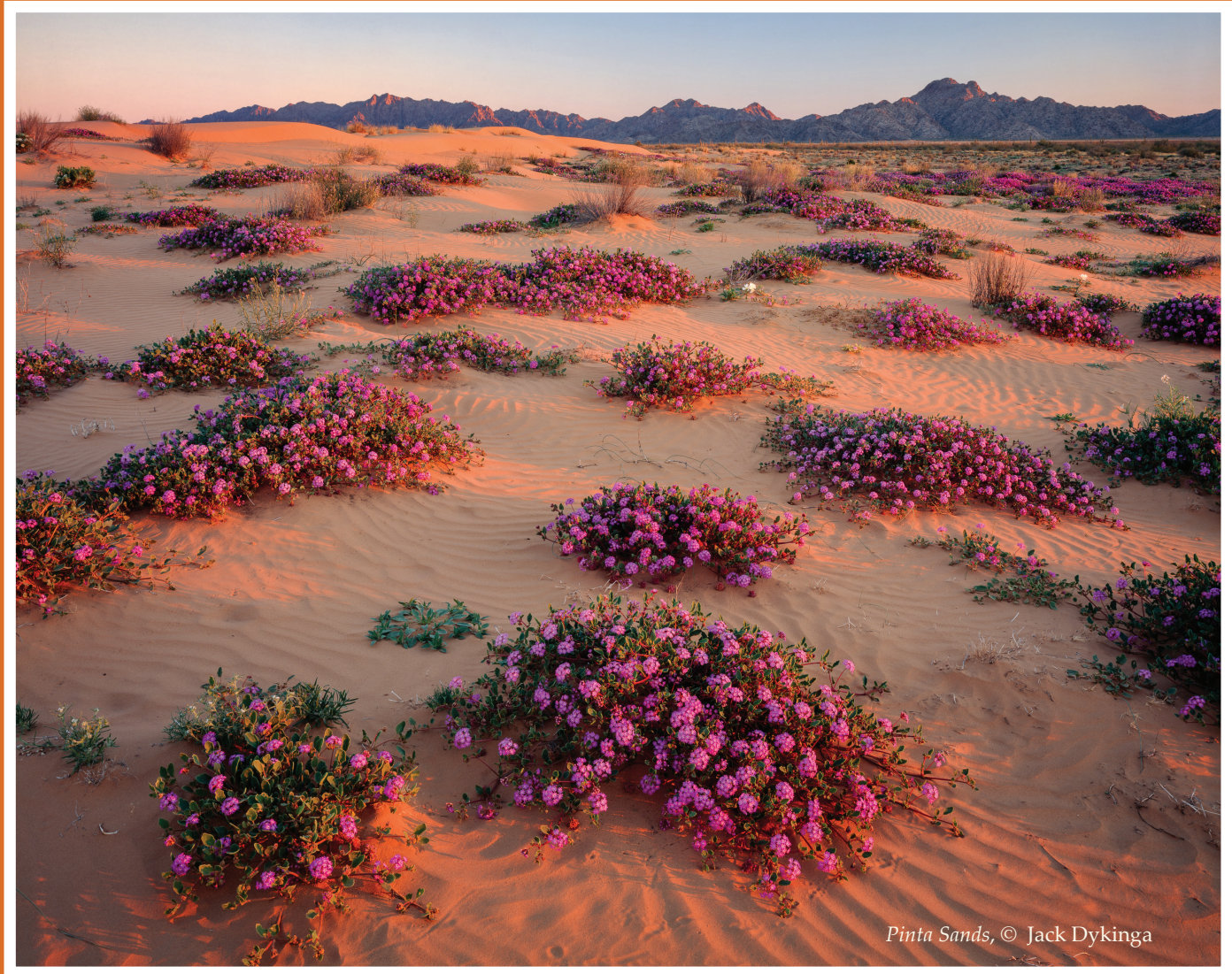
Pinta Sands, © Jack Dykinga